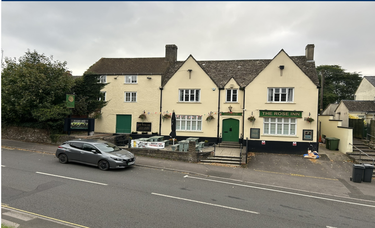
Rose Inn, Paganhill, Stroud, Gloucestershire, GL5 4AW

Substantial Community pub in residential area close to Stroud town centre - £425,000