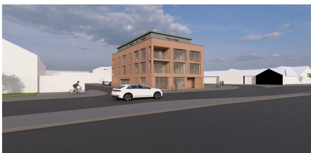
External view of proposal from roadside.