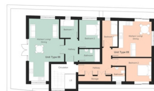
Level 3 (Penthouse)