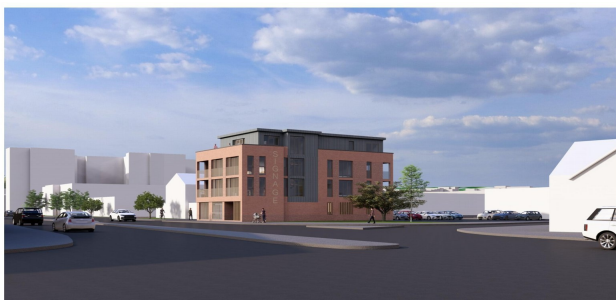
External view of proposal showing signage.