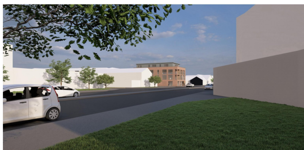
External view of proposal from further down the main road.