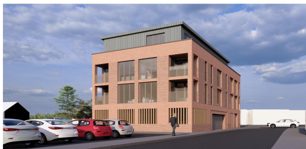
External view of proposal from car park.